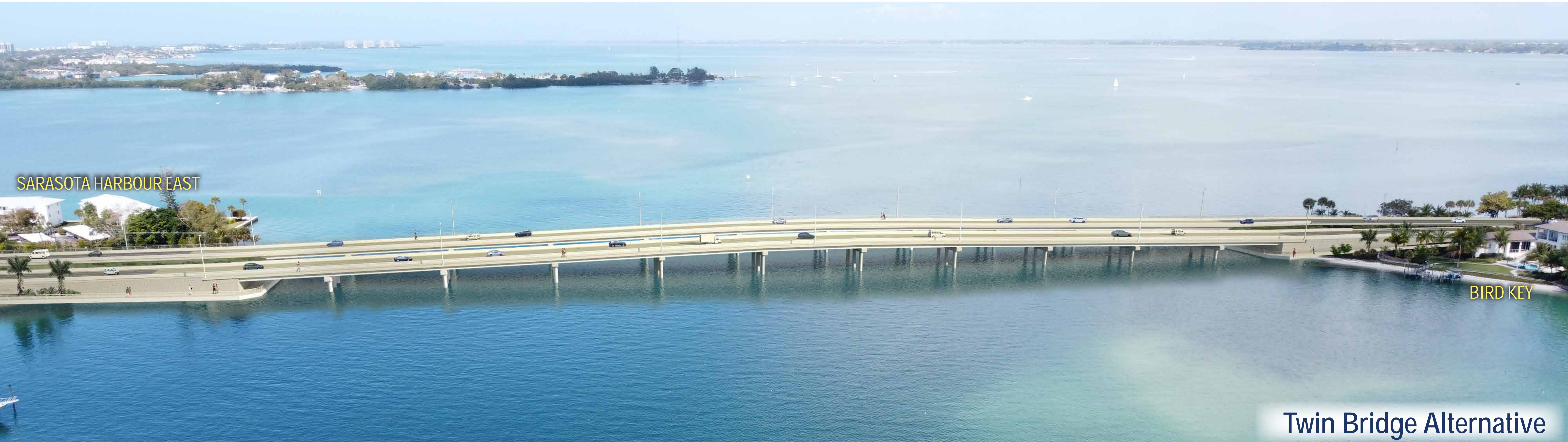
Twin Bridge Alternative