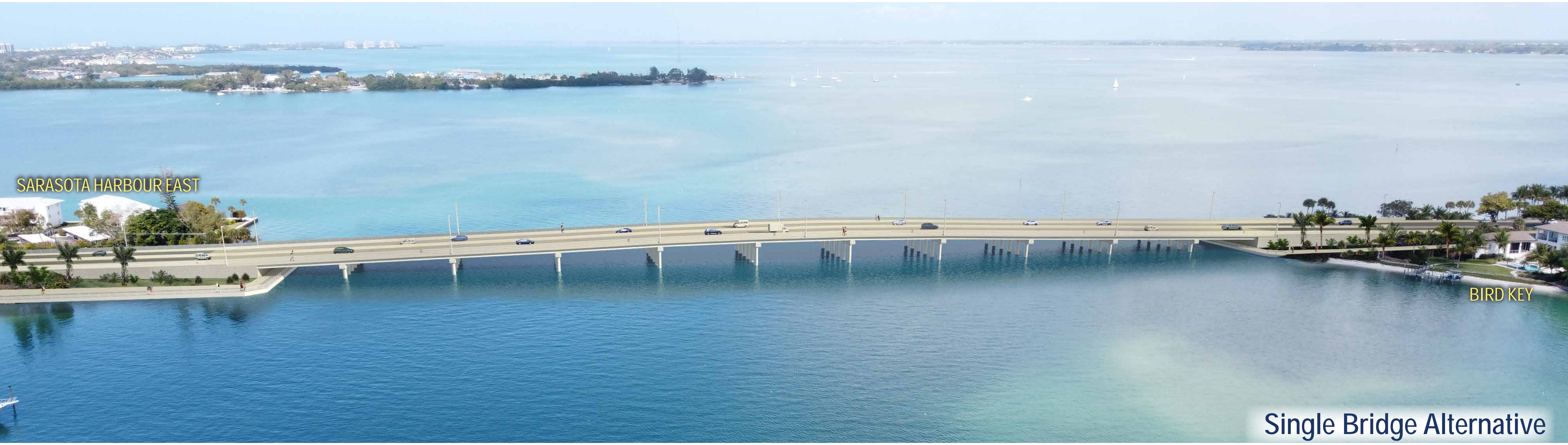
Single Bridge Alternative