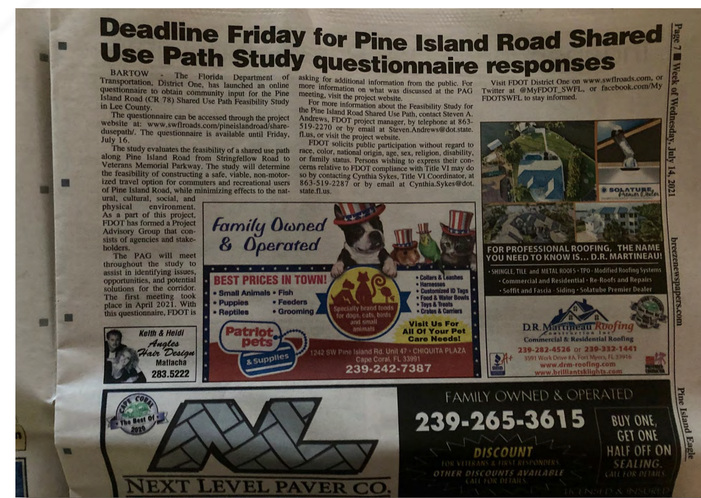
Pine Island Eagle News Coverage July 2021

What top 3 characteristics would affect your choice to use a shared use path along Pine Island Road between Pine Island and Cape Coral?