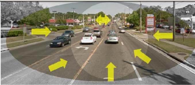
Center Turn Lane Driver Perspective