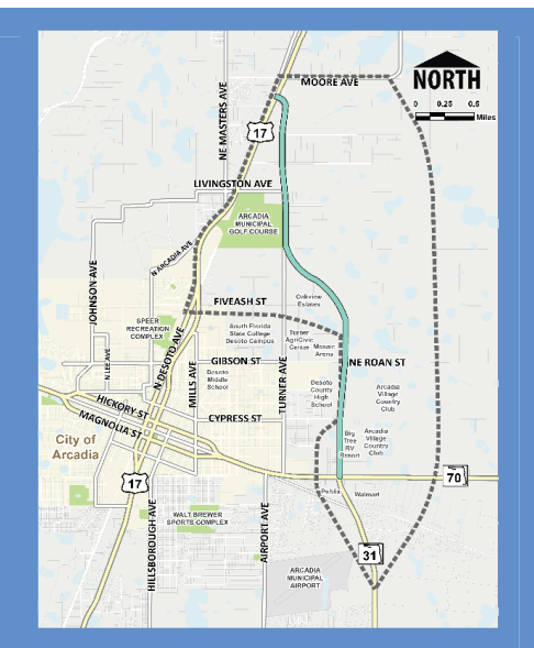
Alternative J begins south of SR 70 and ends at the intersection of US 17 and NE Turner Avenue. The total corridor length is approximately 4.8 miles. Alternative J traverses west of Big Tree RV Resort and follows the eastern boundary of Arcadia Municipal Golf Course.