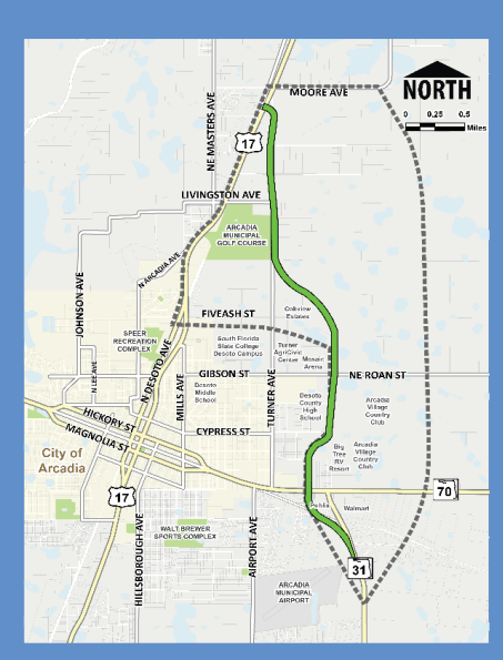
Alternative BJ is a hybrid combination of both Alternative B and Alternative J. It begins south of SR 70 and ends at the intersection of US 17 and NE Turner Avenue. The total corridor length is approximately 4.3 miles. Alternative BJ traverses west of Big Tree RV Resort and follows the eastern boundary of the study area and Arcadia Municipal Golf Course before terminating at US 17 at NE 17th Avenue.