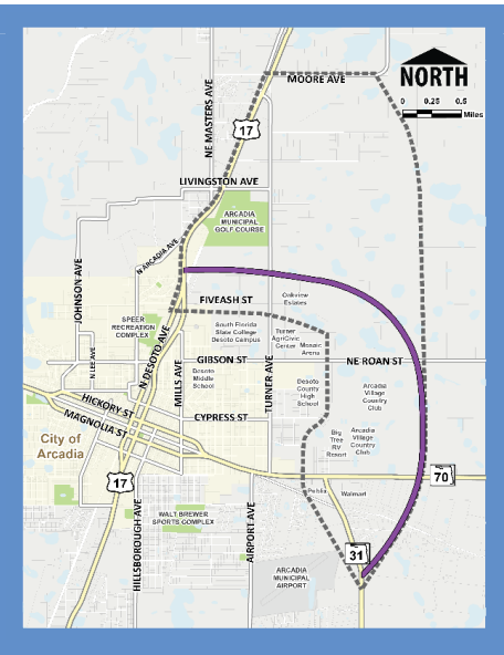
Alternative F begins south of SR 70 and ends at US 17, north of NE Fiveash Street. The total corridor length is approximately 4.3 miles. Alternative F runs along the eastern boundary and to the north of Oakview Estates.