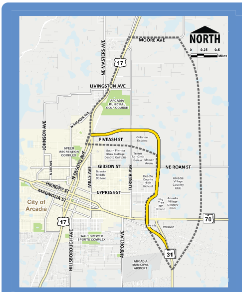
Alternative B begins south of SR 70 and ends at US 17, north of NE Fiveash Street. The total corridor length is approximately 3.7 miles. Alternative B runs along the western study area boundary, west of Big Tree RV Resort.

Five alternatives are under consideration by the study team as part of the SR 31 Extension PD&E Study. A brief description of each alternative is included below along with a map.