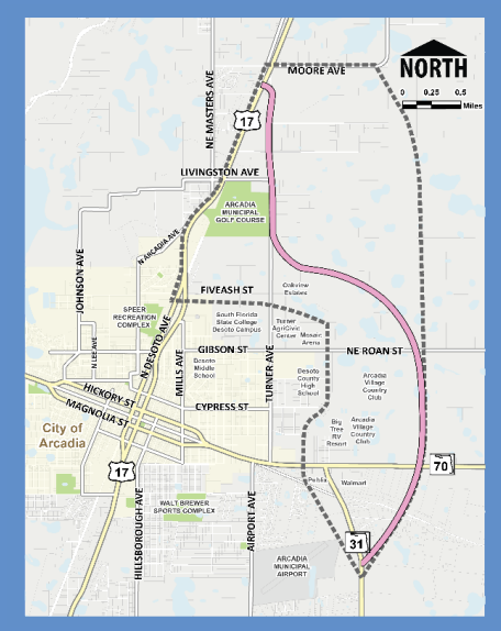
Alternative FJ is a hybrid combinations of both Alternative F and Alternative J. It begins south of SR 70 and ends at the intersection of US 17 and NE Turner Avenue. The total corridor length is approximately 5 miles. Alternative FJ runs along the eastern boundary of the study area and then follows the eastern boundary of Arcadia Municipal Golf Course before terminating at US 17 at NE 17th Avenue.