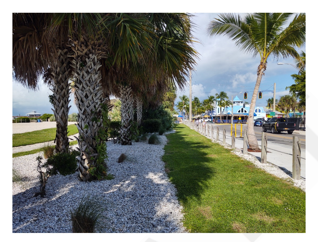
Photo 1. Looking west along north side of Crescent Beach Family Park northern landscape buffer proposed for impact