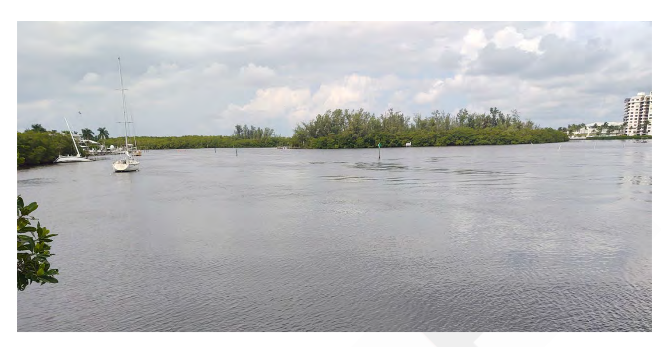
Photo 3. Looking west from Hurricane Bay Bridge along Great Calusa Blueway Paddling Trail alignment.