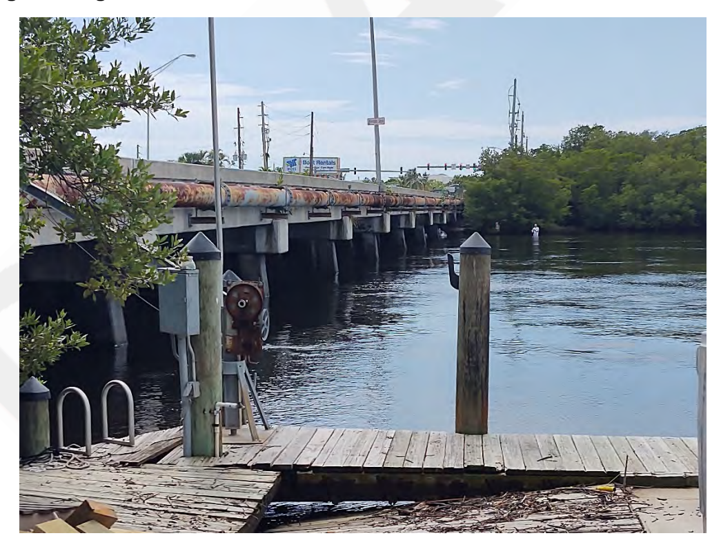
Photo 2. Looking south along the west side of the Hurricane Bay Bridge at Great Calusa Blueway Paddling Trail crossing location under bridge.