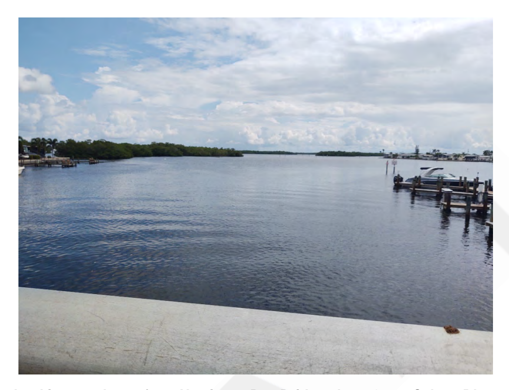
Photo 1. Looking southeast from Hurricane Bay Bridge along Great Calusa Blueway Paddling Trail alignment.