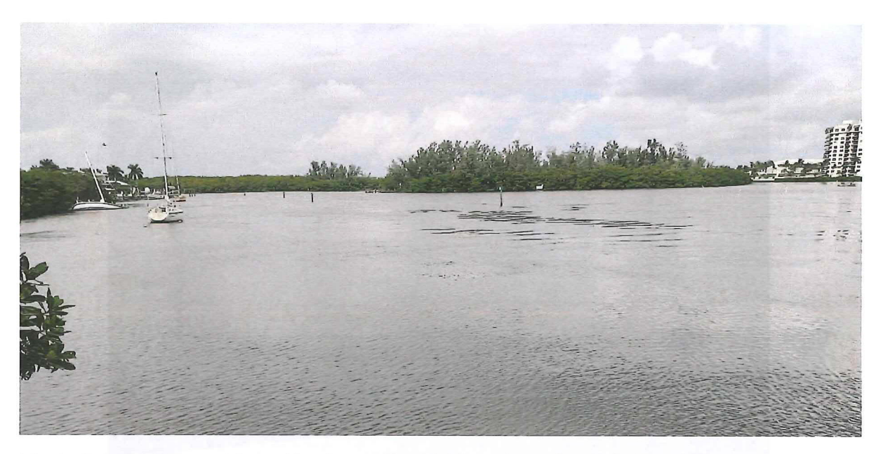
Photo 3. Looking west from Hurricane Bay Bridge along Great Calusa Blueway Paddling Trail alignment.