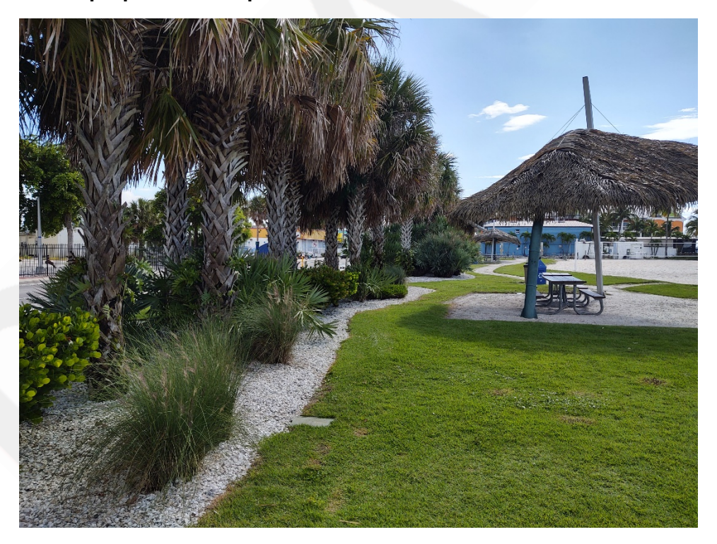
Photo 2. Looking east along south side of Crescent Beach Family Park northern landscape buffer proposed for impact