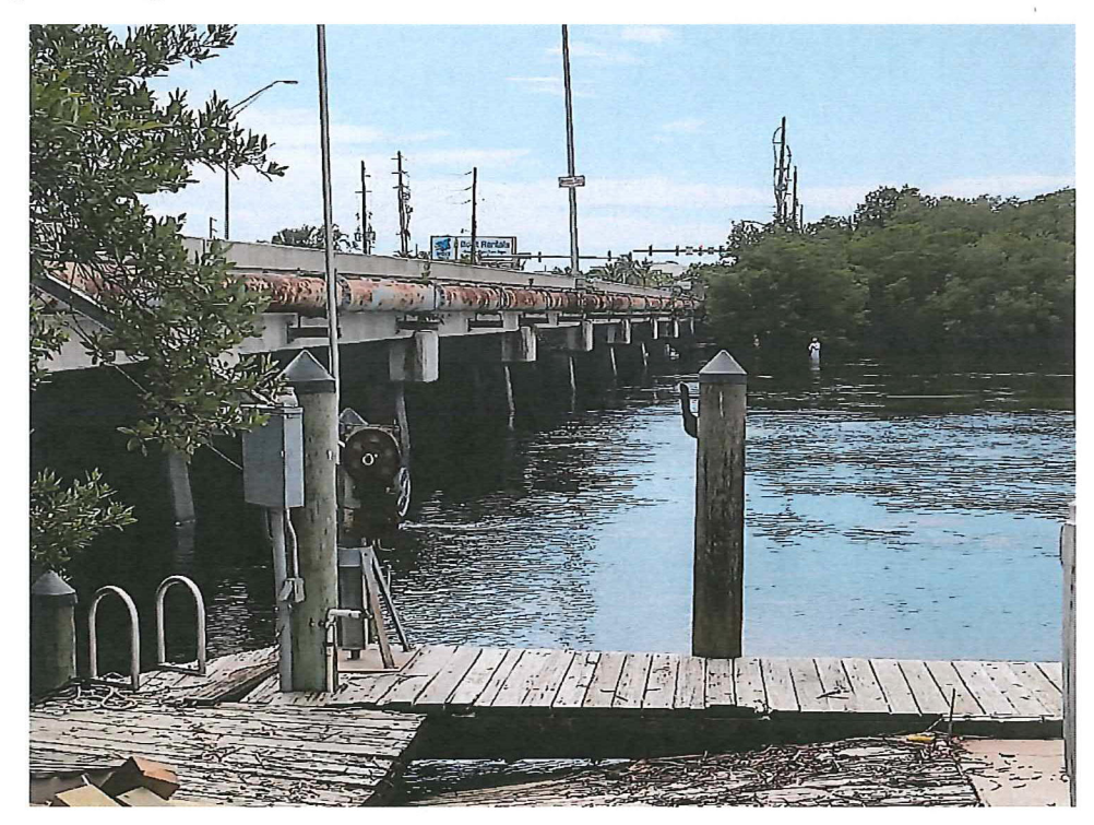
Photo 2. Looking south along the west side of the Hurricane Bay Bridge at Great Calusa Blueway Paddling Trail crossing location under bridge.