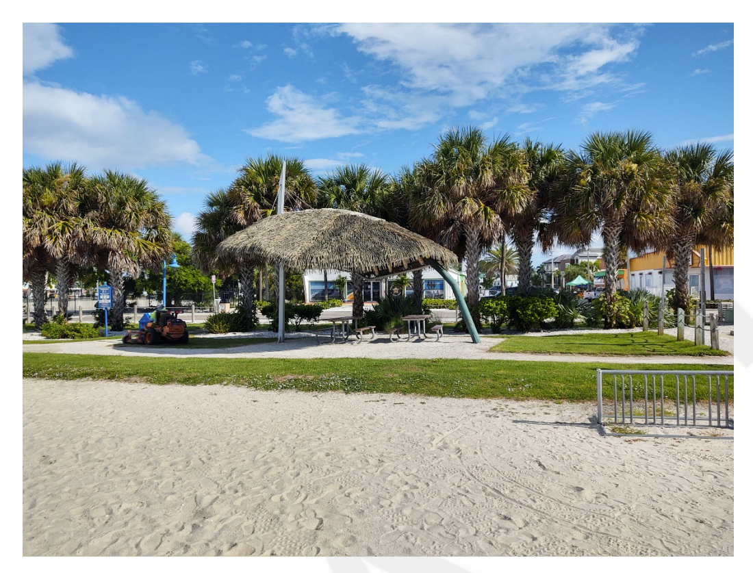
Photo 5. Looking north at Crescent Beach Family Park northern landscape buffer proposed for impact (between picnic pavilion structure and SR 865)