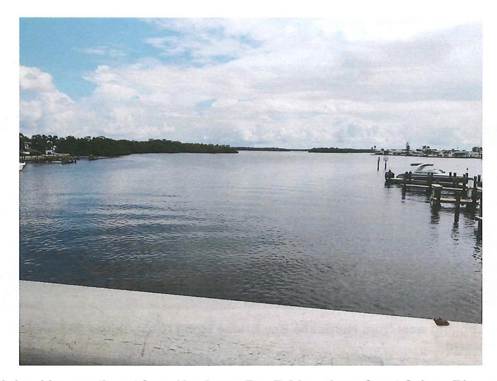
Photo 1. Looking southeast from Hurricane Bay Bridge along Great Calusa Blueway Paddling Trail alignment.