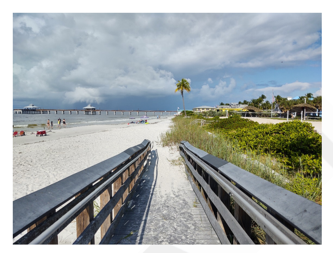
Photo 3. Looking west down ADA beach access ramp at southern portion of Crescent Beach Family Park