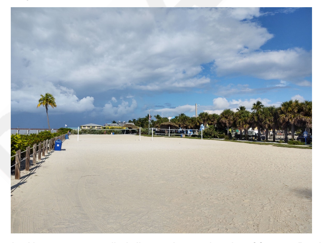
Photo 4. Looking west across volleyball courts in central portion of Crescent Beach Family Park