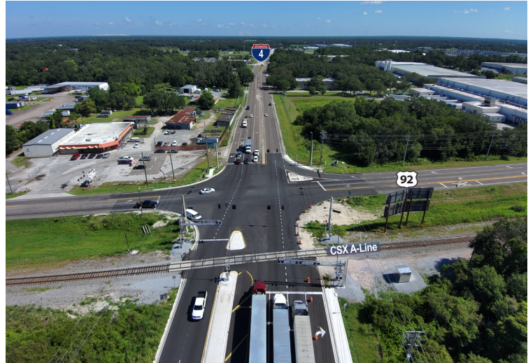
County Line Road at-grade crossing with CSX A-Line (Looking North)

The Florida Department of Transportation (FDOT), District One, is beginning a Feasibility Study to evaluate the separation of CSX A-Line and County Line Road in Polk and Hillsborough Counties that removes all vehicle and pedestrian conflicts with CSX Railroad. This study will include traffic operation and pedestrian improvements along both County Line Road and US 92. The County Line Road study limits extends from Amberjack Boulevard north to Frontage Road south. These improvements are intended to enhance safety for the traveling public along the County Line Road corridor. If a feasible alternative is developed, the study will advance to a Project Development and Environment (PD&E) Study.