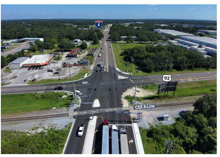
County Line Road at-grade crossing with CSX A-Line (Looking North)

The Florida Department of Transportation (FDOT), District One, is beginning a County Line Road Feasibility Study to evaluate the separation of CSX A-Line and County Line Road in Polk and Hillsborough Counties. This study will include traffic and pedestrian improvements along both County Line Road and US 92. The County Line Road study limits extend from Amberjack Boulevard north to Frontage Road south. These improvements are intended to enhance safety for the traveling public along the County Line Road corridor by separating the vehicle and pedestrian movements from the railroad crossing. If a feasible alternative is developed, the study will advance to a Project Development and Environment (PD&E) Study.