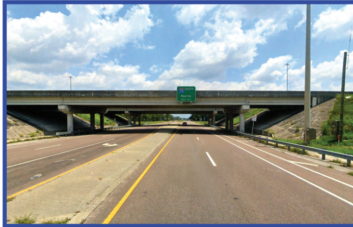
TOLEDO BLADE BOULEVARD

Florida Department of Transportation District One 801 North Broadway Ave. Bartow, Florida 33830