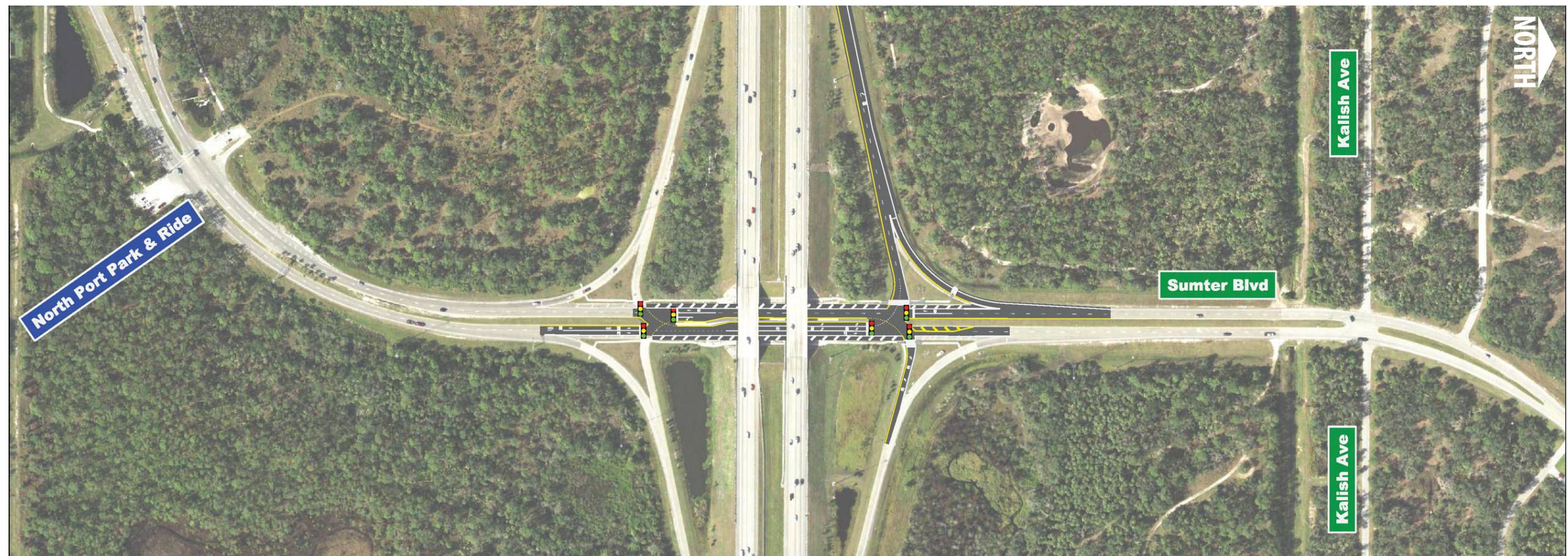
I-75 at Sumter Boulevard Interchange