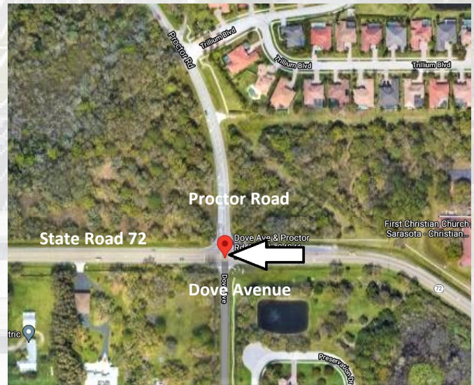
Aerial view of the construction zone, where SR 72 intersects Proctor Road and Dove Avenue